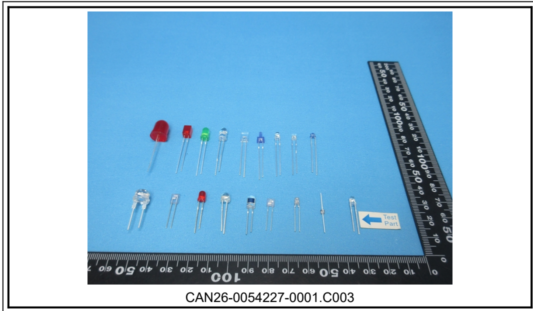
此照片仅限于随 SGS 正本报告使用 ***报告结束***